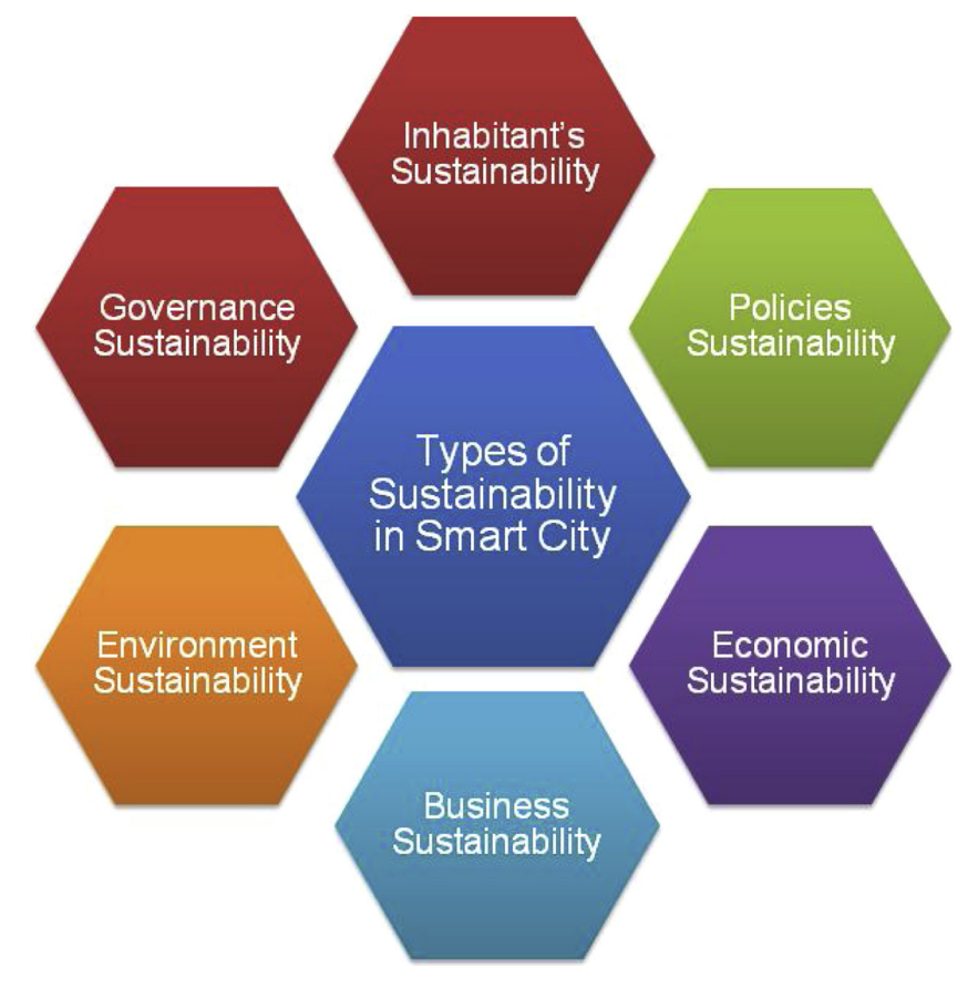
Fig. 4. Types of Sustainability in a Smart City.

There is an urgent need for devising the mechanisms so that the consumption of resources (natural and man-made) must be administered and monitored keeping in view the future generations. The United Nation's SDGs also point in the direction of achieving sustainability in every aspect of life. Another important factor which is to be considered while designing the smart city ecosystem is the optimal management of waste generated through computing or other developments (including e-waste). The underlying infrastructure of the smart city must be able to interface with the strong and dynamically evolving prediction algorithms so that the future needs and expenses are estimated well before time and preventive measures can be taken if the need arises. This predictive analysis is highly crucial for the successful implementation of the smart city ecosystem (Al Ridhawi et al., 2020; Silva et al., 2018). There exist several types of sustainability in a typical smart city ecosystem as shown in Fig. 4.