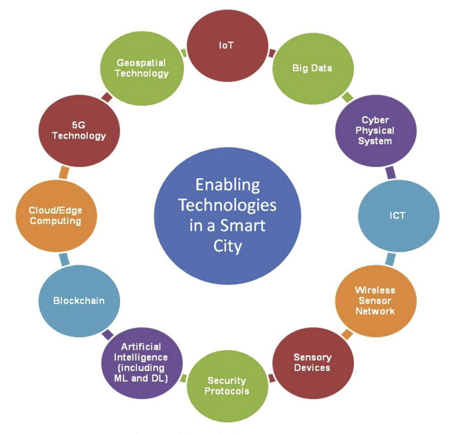
Fig. 2. Enabling Technologies in Smart City.

Microsoft and Google etc (Armbrust et al., 2010; Mell & Grance, 2011). The edge computing enables the users to perform quick and lighter computations right on the edge of a network rather than requiring to transfer the whole data on the cloud for processing (Hu, Patel, Sabella, Sprecher, & Young, 2015; Mao, You, Zhang, Huang, & Letaief, 2017). This makes the response time much faster and making the system takes decision in near real time.