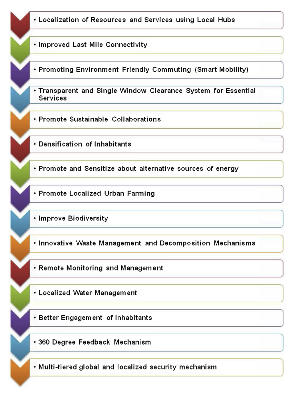
Fig. 5. Roadmap for Sustainable Smart Cities.

cities must integrate state-of-the-art technologies and solutions to tackle the issues of clean water shortage, depleting air quality, diminishing natural resource reserves and ecological imbalance (Tanguay, Rajaonson, Lefebvre, & Lanoie, 2010).